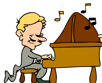
play the piano (played)