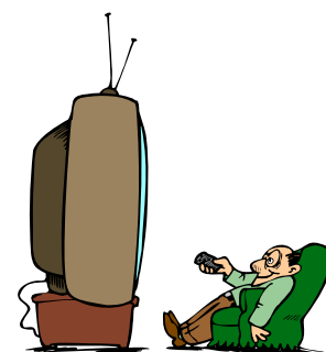
watch TV (watched)