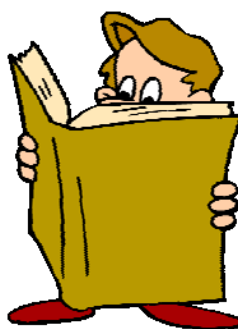
read a book (read)