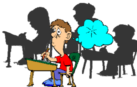
take a test (took)