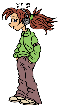
listen to music (listened)