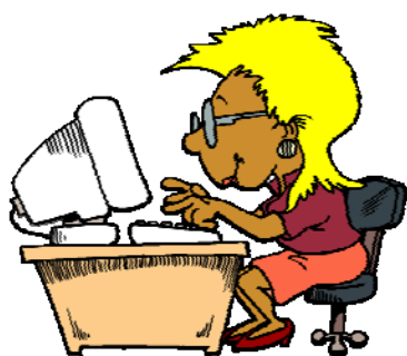
use a computer (used)