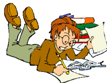
do homework (did)