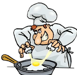
cook dinner (cooked)