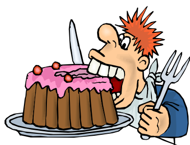
eat dessert (ate)