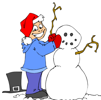
make a snowman (made)