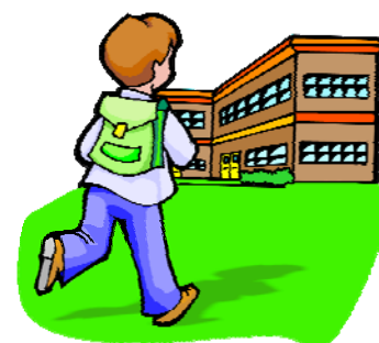
come to school (came)