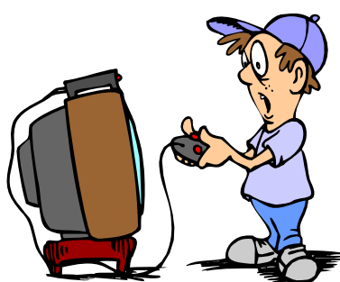
play video games (played)