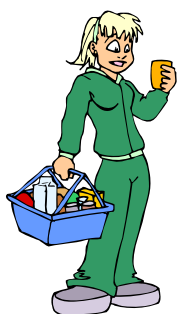
go shopping (went)