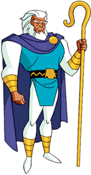
Name: King of the sea