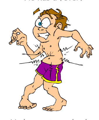
He has a stomachache.