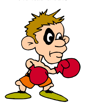
He has a bruise.