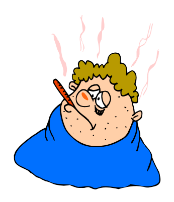
He has a fever.