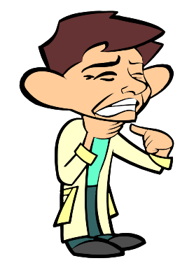
He has a sore throat.