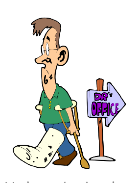
He has a broken leg.