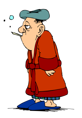
He has a cold.