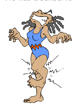
She has a cramp.